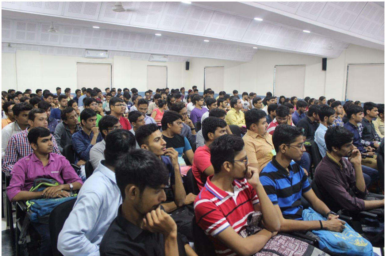
6. students paying attention to the primavera demonstration.